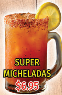
SUPER MICHELADAS $6.95