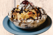
FRIED ICE CREAM $8.95