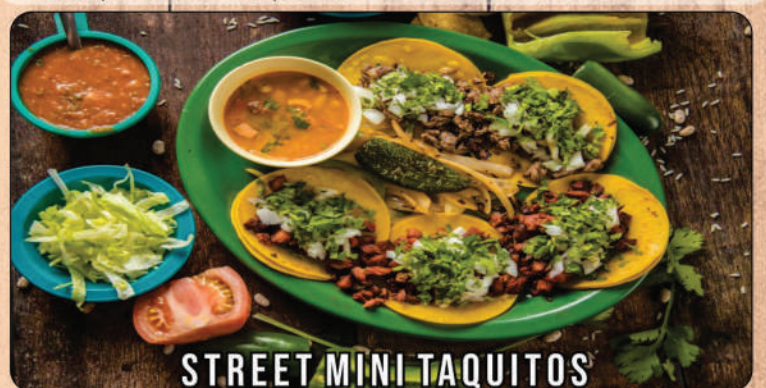
STREET MINI TAQUITOS

DELUX BEEF TACOS Filled with lettuce, tomatoes and grated cheese. Add rice and beans for $3.95 beef tacos (2) $ 6.95 (3) $ 9.95 Chicken tacos (2) $ 6.95 (3) $ 9.95 Bean Tacos (2) $ 6.95 (3) $ 8.95 Guacamole tacos (2) $ 6.95 (3) $11.95 STREET MINI TACOS (5) $12.95 Pastor, chicken or beef, served with onions and cilantro. BARBACOA TACOS (5) $13.95 Pastor, chicken or beef, served with onions and cilantro.