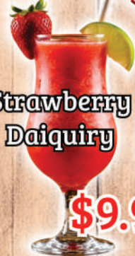
Strawberry Daiquiry $9.95