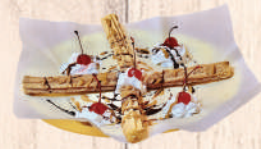
CHURROS (4) $8.95 (8) $11.95