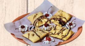
SOPAPILLAS (4) $8.95 (8) $11.95