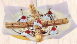
CHURROS (4) $8.95 (8) $11.95