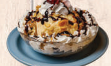
FRIED ICE CREAM $8.95