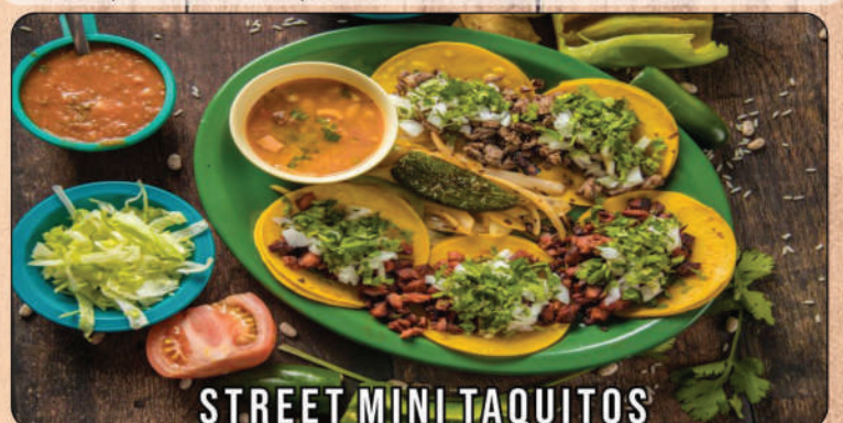
STREET MINI TAQUITOS

DELUX BEEF TACOS Filled with lettuce, tomatoes and grated cheese. Add rice and beans for $3.95 beef tacos (2) $ 7.95 (3) $10.95 Chicken tacos (2) $ 7.95 (3) $10.95 Bean Tacos (2) $ 7.95 (3) $ 9.95 Guacamole tacos (2) $ 8.95 (3) $11.95 STREET MINI TACOS (5) $14.95 Pastor, chicken or beef, served with onions and cilantro. BARBACOA TACOS (5) $13.95 Pastor, chicken or beef, served with onions and cilantro.