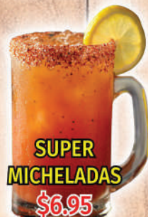
SUPER MICHELADAS $6.95