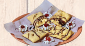
SOPAPILLAS (4) $8.95 (8) $11.95