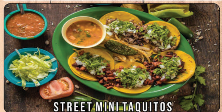
STREET MINI TAQUITOS

Enjoy our delicious MENUDO weekends only.