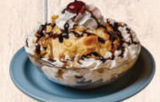
FRIED ICE CREAM $8.95