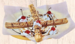
CHURROS (4) $8.95 (8) $11.95