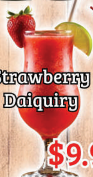
Strawberry Daiquiry $9.95