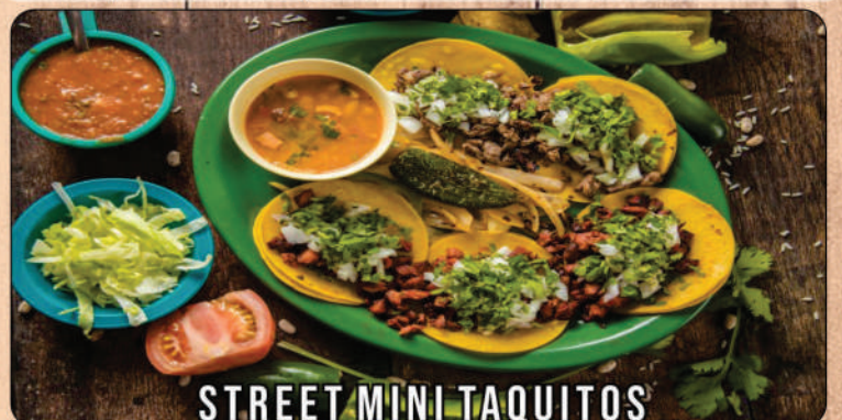
STREET MINI TAQUITOS

Pastor, chicken or beef, served with onions and cilantro.