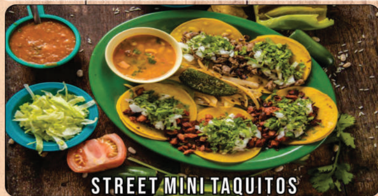
STREET MINI TAQUITOS

DELUX BEEF TACOS Filled with lettuce, tomatoes and grated cheese. Add rice and beans for $3.95 beef tacos (2) $ 6.95 (3) $ 9.95 Chicken tacos (2) $ 6.95 (3) $ 9.95 Bean Tacos (2) $ 6.95 (3) $ 8.95 Guacamole tacos (2) $ 6.95 (3) $11.95 STREET MINI TACOS (5) $12.95 Pastor, chicken or beef, served with onions and cilantro. BARBACOA TACOS (5) $13.95 Pastor, chicken or beef, served with onions and cilantro.