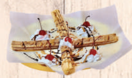
CHURROS (4) $8.95 (8) $11.95