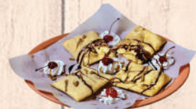
SOPAPILLAS (4) $8.95 (8) $11.95